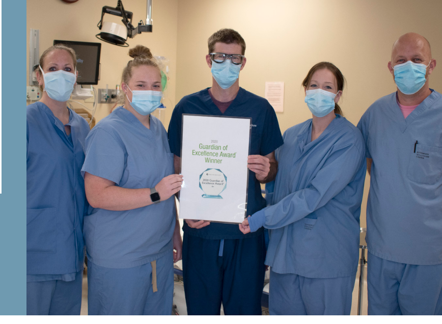
In 2020, Riverwood Healthcare Center received the Guardian of Excellence Award® from Press Ganey for its outstanding emergency care patient experience.

Fiscal Year 2020 Financials Report for Riverwood Healthcare Center