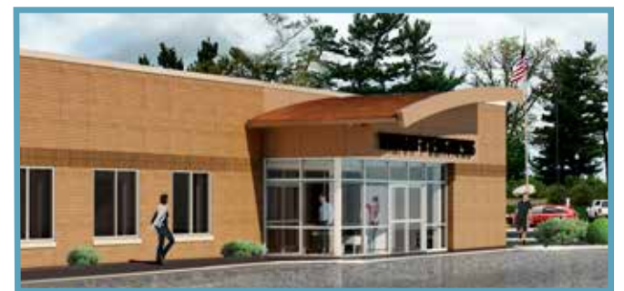
Architectural rendering of new Riverwood Rehabilitation entrance.